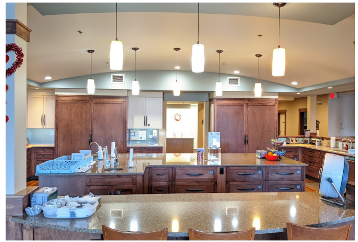
ABOVE The Interior of the Red Deer House.

Whenever and for as long as you need us—you're welcome here.