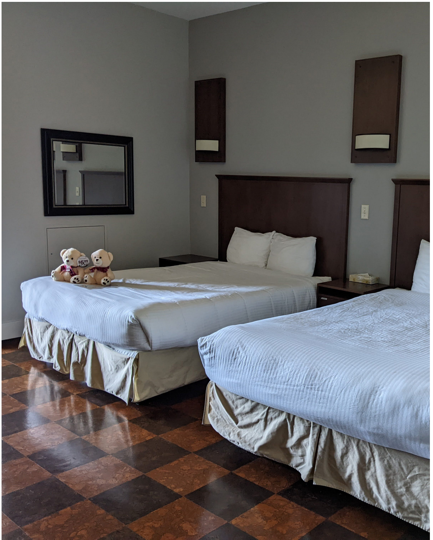
ABOVE The Interior of the Red Deer House.