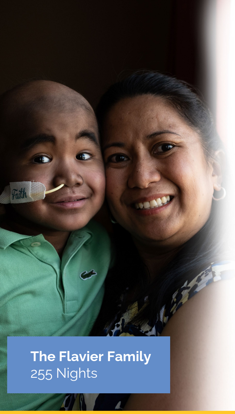
The Flavier Family 255 Nights