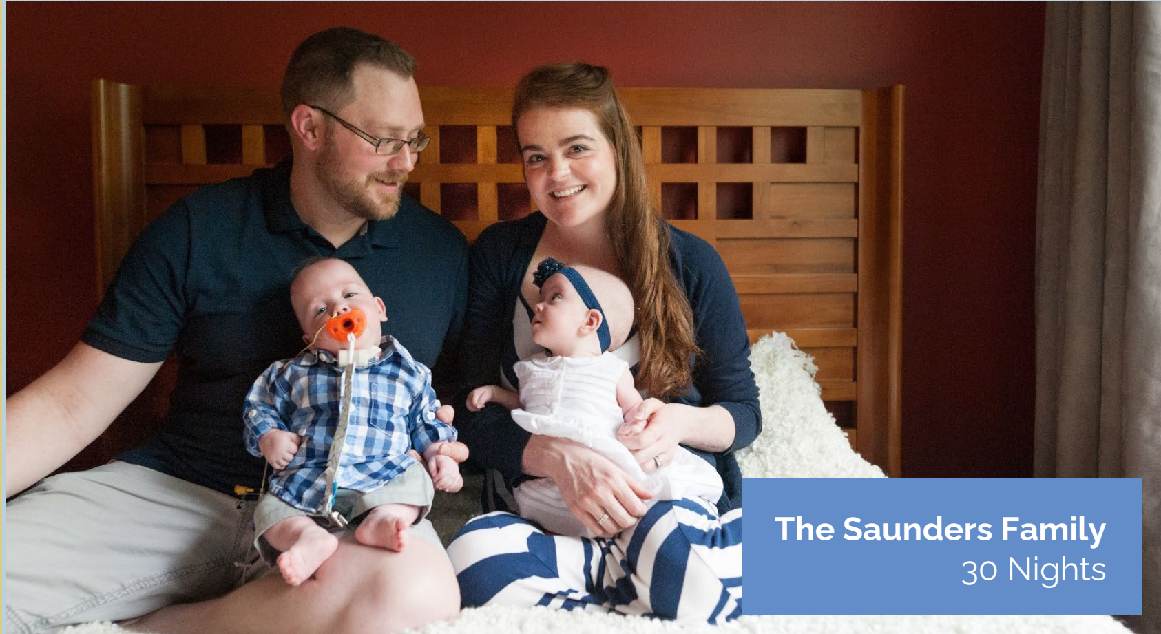
The Saunders Family 30 Nights