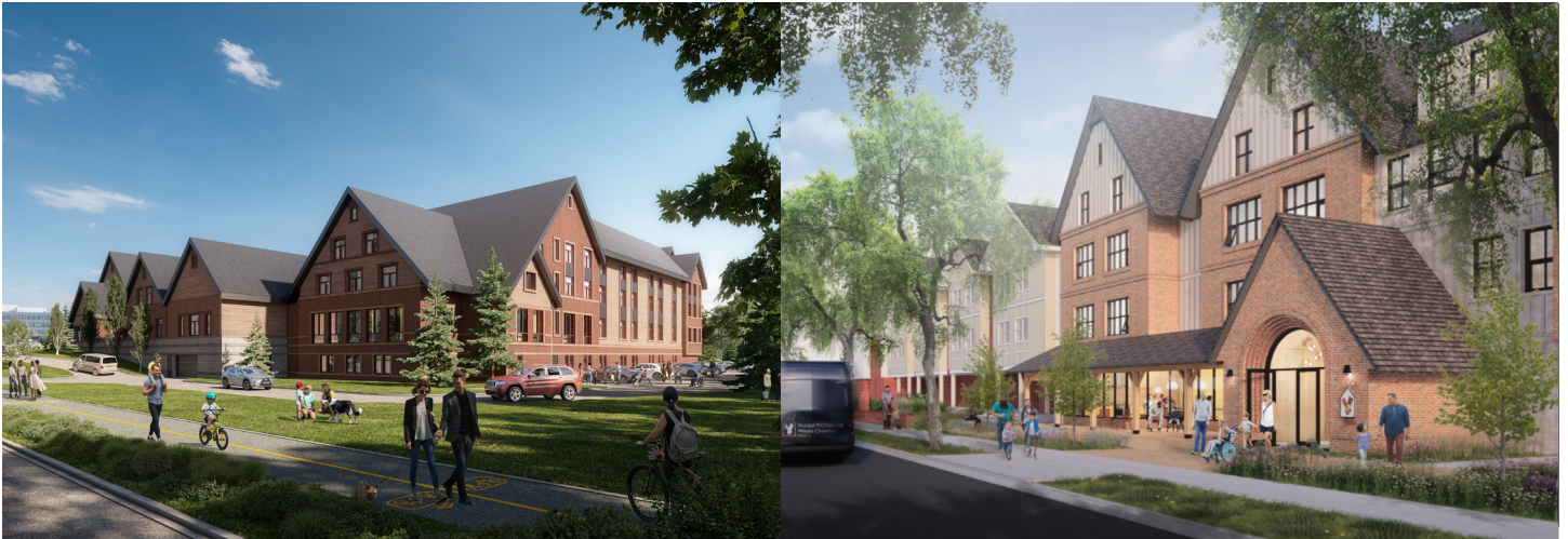
Calgary rendering pictured on the left. Edmonton rendering pictured on the right.